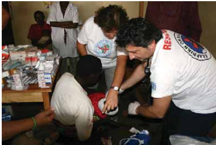
The Hellenic Rescue Team is assisting

The team received children's clothing through custom clearance, sent to Burundi by students from Greek schools in New York for the children of Burundi.