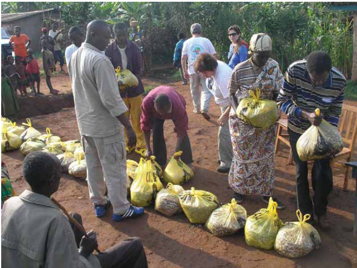
Distribution of beans in Burundi

Difficulties are faced in countries where there is no foodstuff to be purchased in the inland markets, like Somalia, so food has to be brought from neighbouring countries