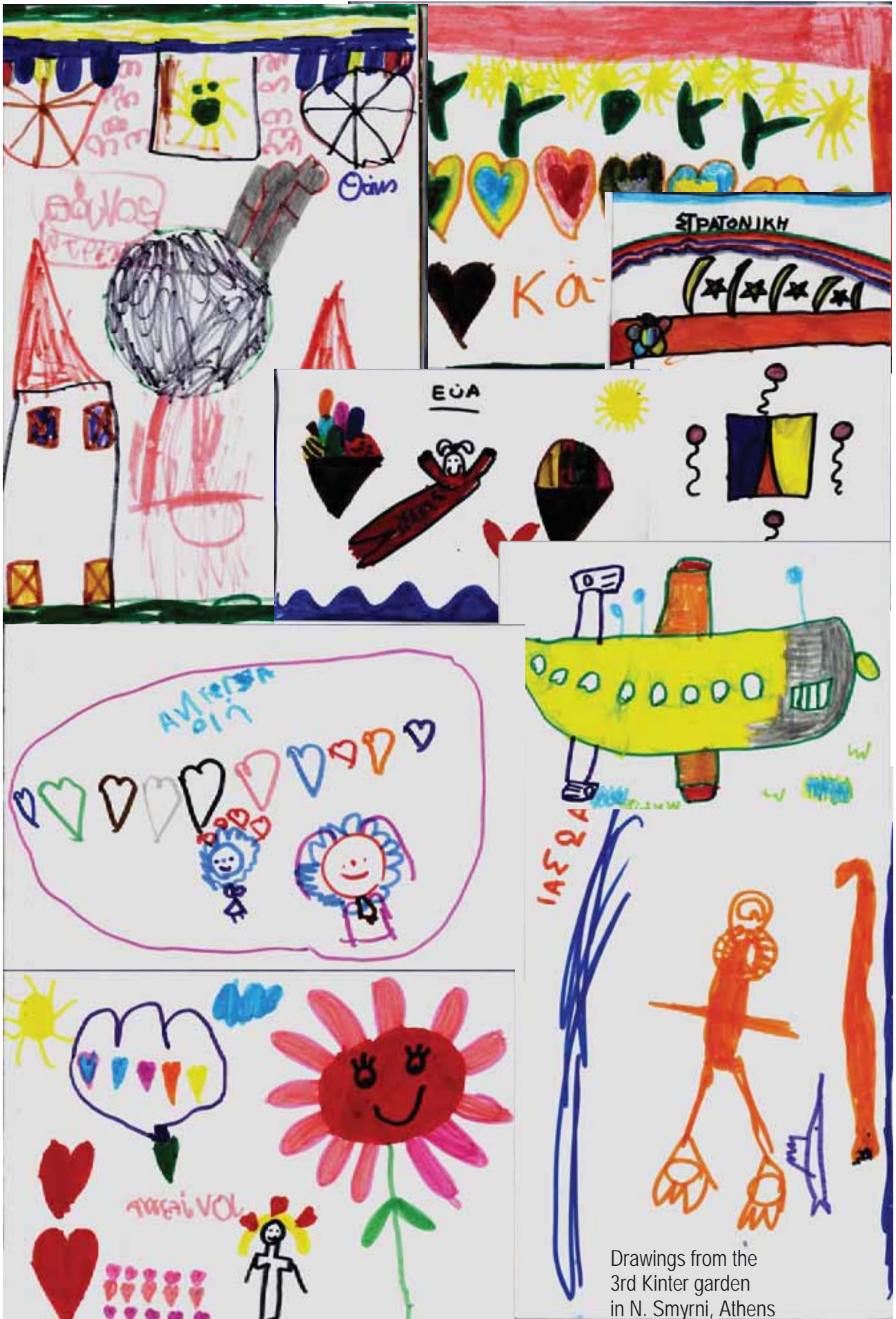
Drawings from the 3rd Kinder garden in N. Smyrni, Athens