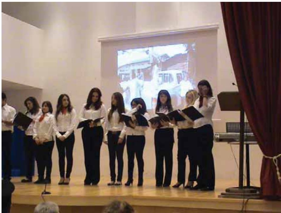
Singers of Kremasti, Rhodes