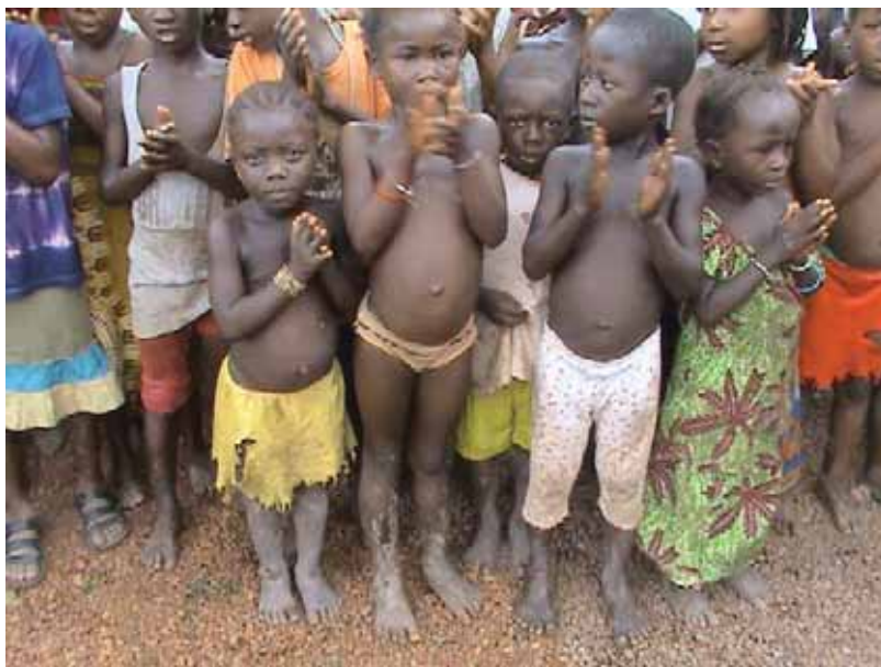
Children of Sierra Leone