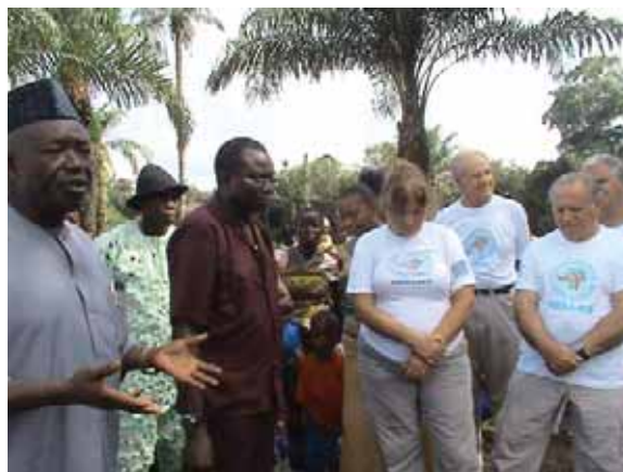
The traditional ruler addressing his people

Following a farewell ceremony by the local people with traditional songs, the team left the district.