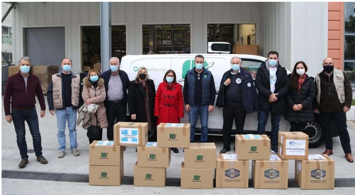
Medicine donation from the Piraeus Pharmaceutical Association and the "Pharmacists of the world"