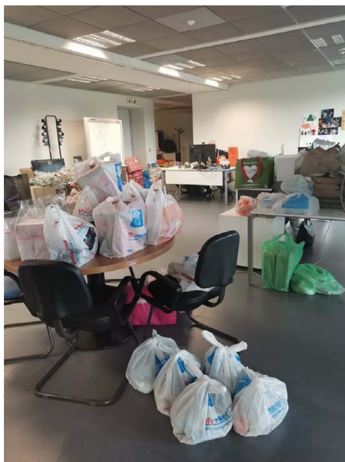
Donation of food, toys, school items, etc. from the employees of COSMOTE