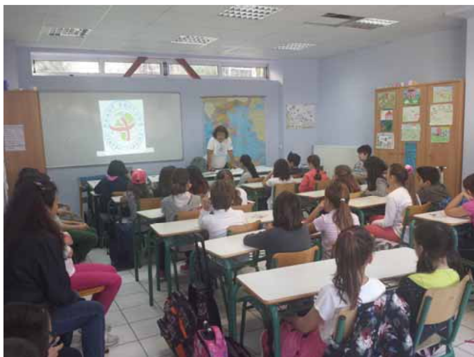
23.11.2017, General High School of Rhodes