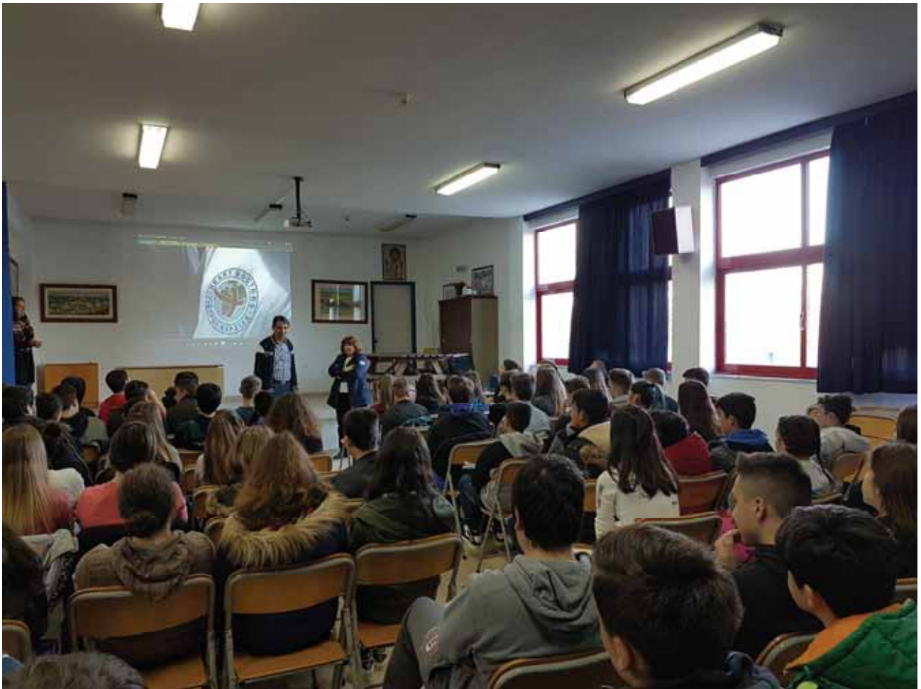
10.7.2017, Center for the Creative Employment of Children of the Municipality of Vari-Voula-Vouliagmeni