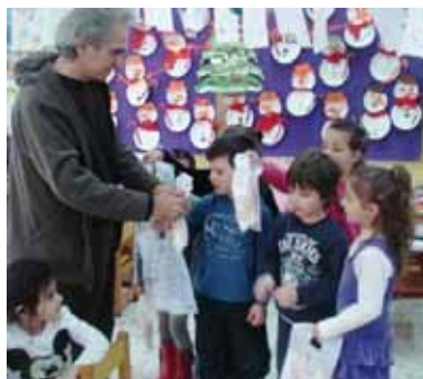
Children of the 5th Kindergarten of Keratsini donating Medicine

During the year 2013 many people donated school and athletic material, clothing and shoes to the Heliopetra minority primary school. Among them were the parent society of Moraitis School, "KLEPSIDRA" bookstore in Kalyvia and the Athletic Association in Kalyvia Thorikou.