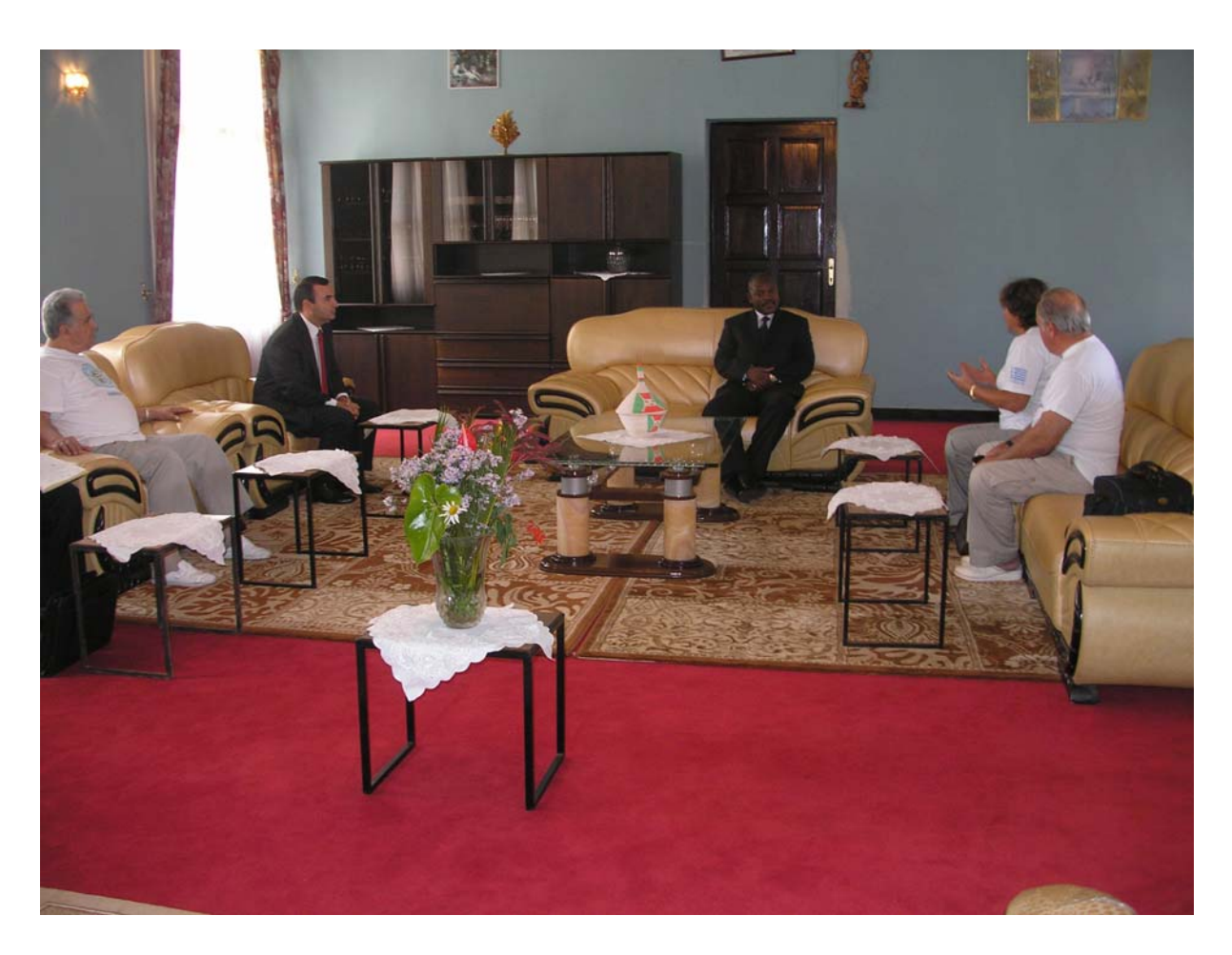
Visit to the President of the Republic of Burundi. Ngozi-Burundi