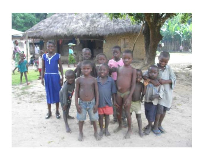
Children of Sierra Leone