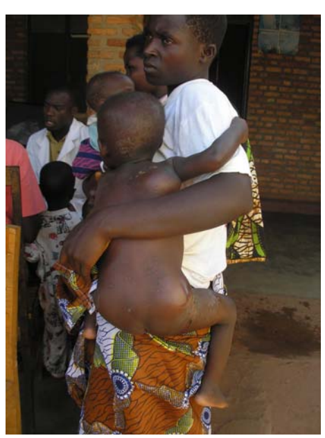
Child suffering from multiple abscess