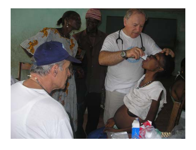
Giving medicine to a sick woman