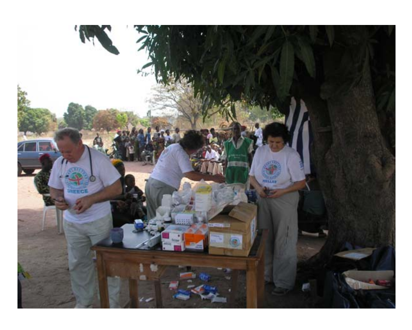
Open-air dispensary in Nigeria