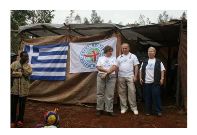
Open-air dispensary in Burundi