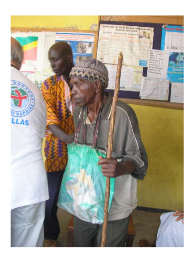
Sierra Leone. A blind visits the dispensary