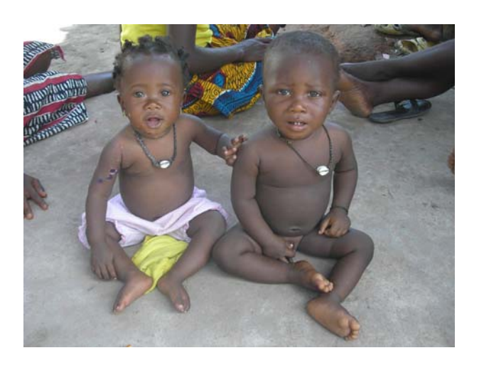
Waiting for the examination