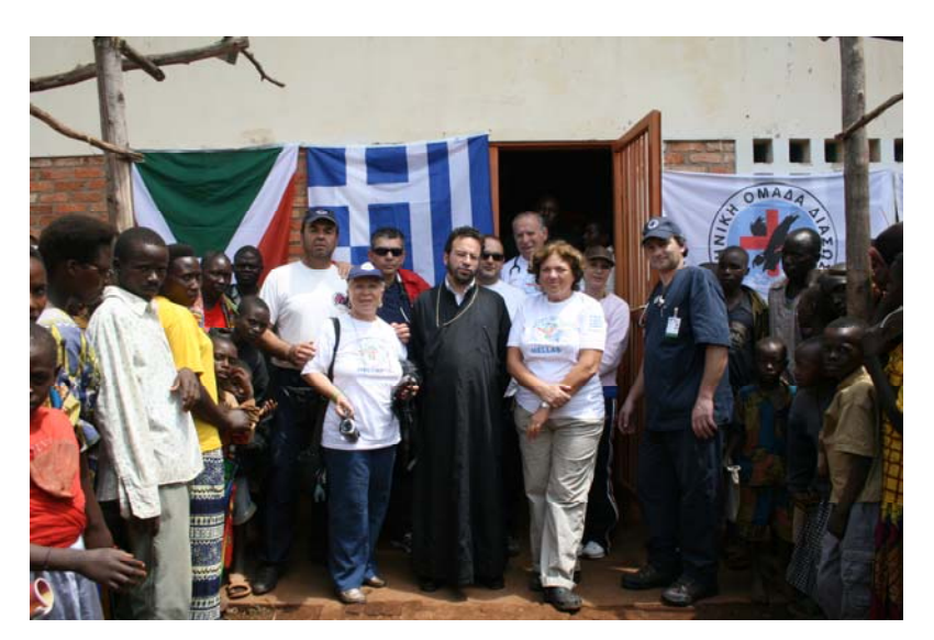
With the Archbishop of Rwanda-Burundi and the Hellenic Rescue Team