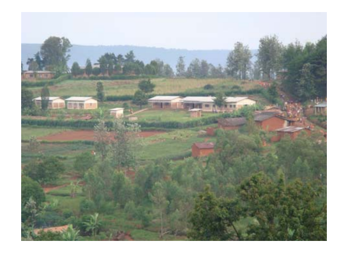
Gisuru hospital. Nurses Residence Wing

Fifty metal beds, matresses, blankets, sheets and other kinds of necessary items were purchased and allocated to the clinics of the hospital. The hospital is now complete and properly equipped.