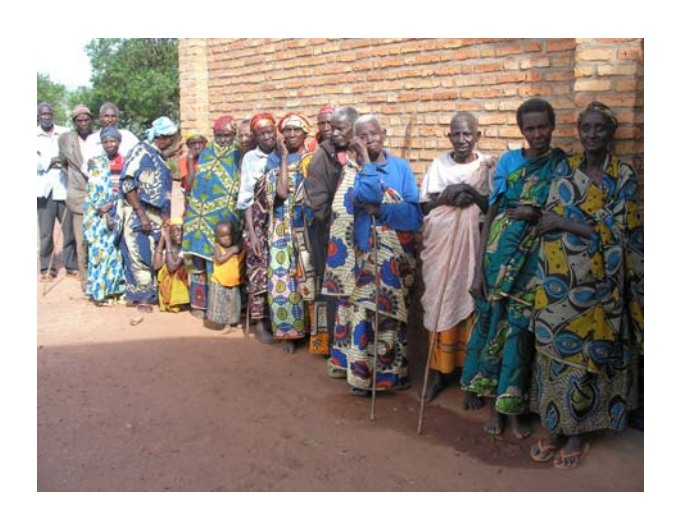
A queue of patients outside the dispensary