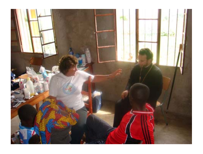
With the Archbishop of Rwanda-Burundi, Karuzi