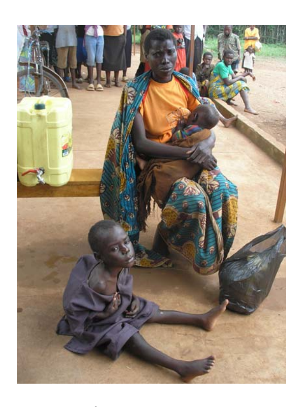
Waiting for the examination, Burundi