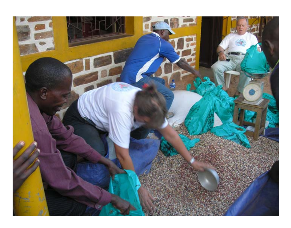
Distributing foodstuffs in Burundi