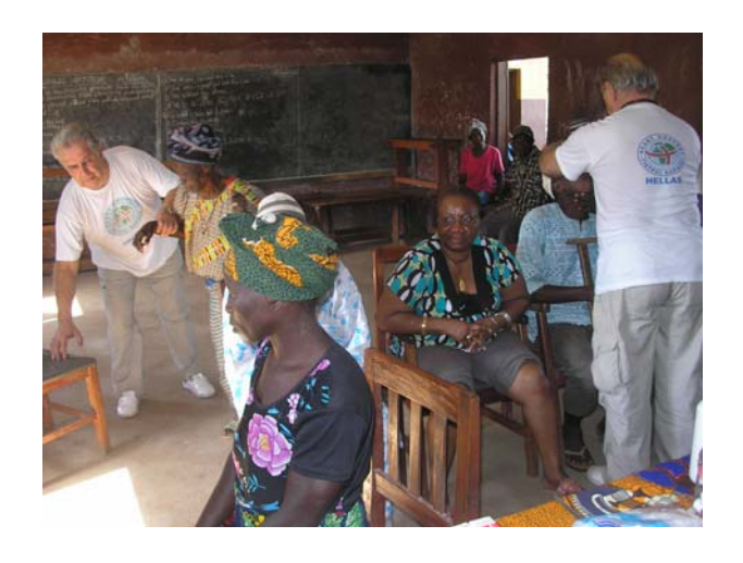
Dispensary in Sierra Leone

A four member team of "Heart Doctors" visited the district Tonkolili, belonging to the North Province of Sierra Leone ( its capital is Magburaka, 400 kilometers off Freetown ). The team settled at the village Yelle and starting from there every morning it visited the communities Manovo, Yeben, Marak, Petifu Mayeroh and Mafay. Thousands of patients were examined. Milk for undernourished babies was offered to parents.