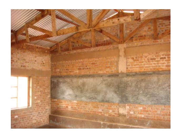
Nyabikere. Interior of the new school building