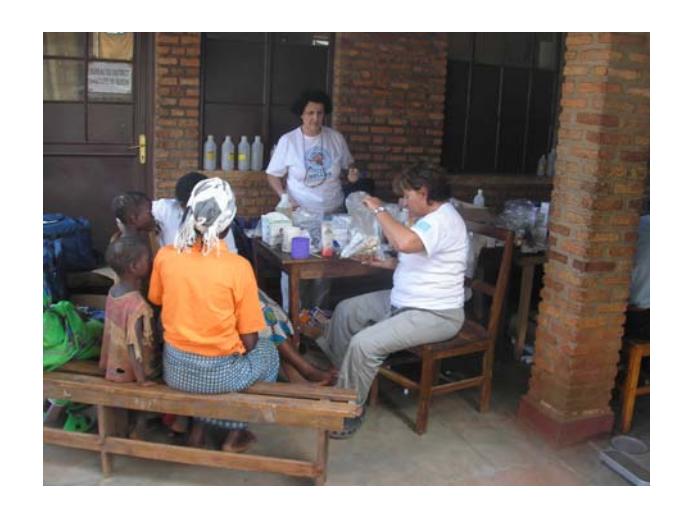
Dispensary at a village, Karuzi province, Burundi