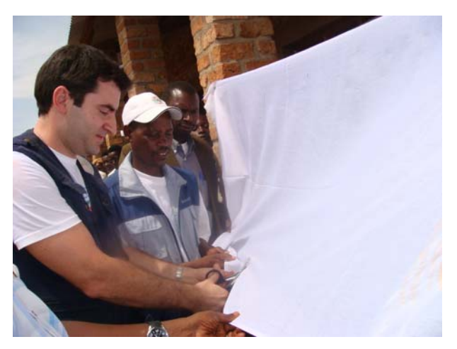
Inauguration of the new school building at Nyabikere