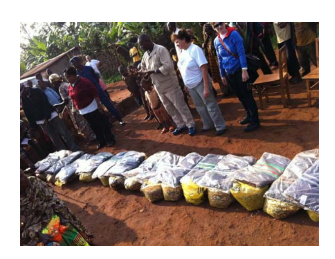
Distribution of foodstuffs in Burundi