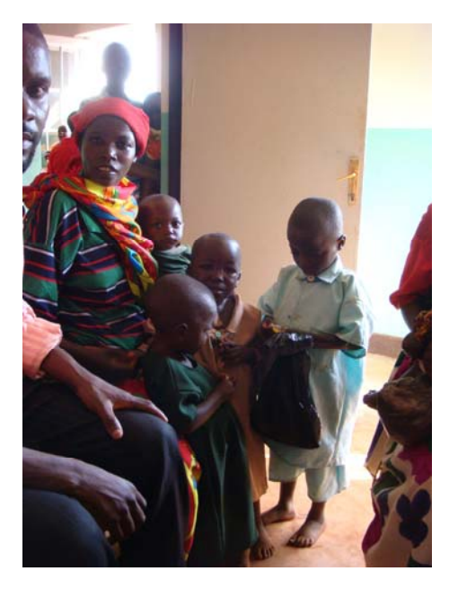
Parents with their children at the dispensary, Karuzi