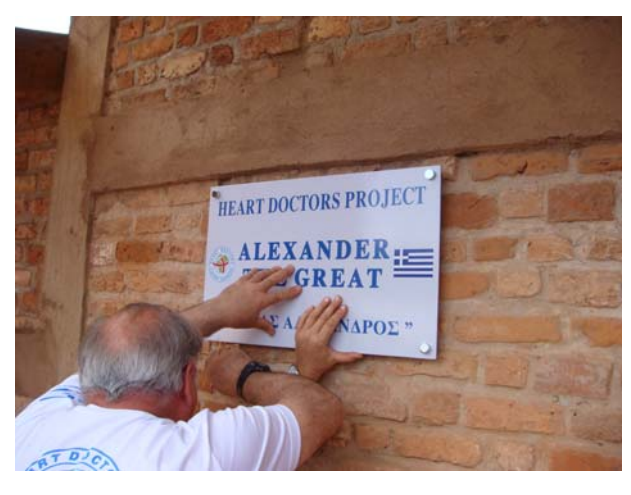
New school building at Nyabikere. Fixing the commemorative plate