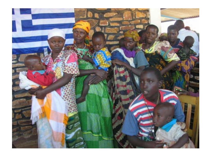
Parents with their children at the dispensary