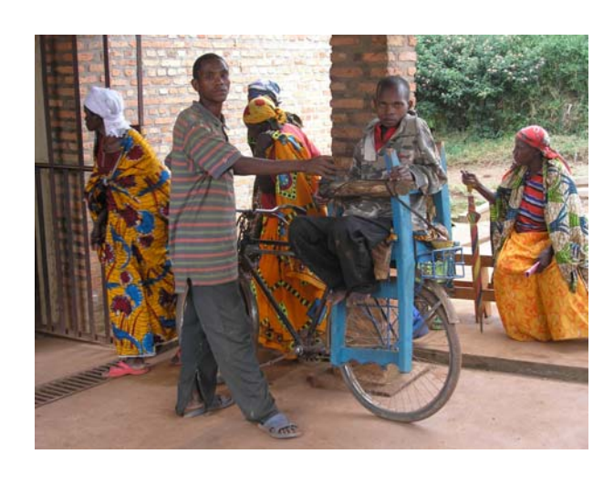
Patients taken to the dispensary