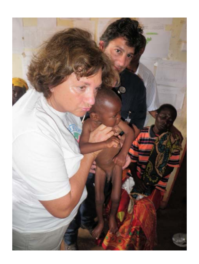
Dispensary at a remote village, Burundi