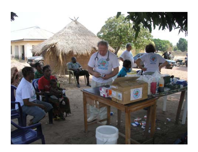
Open-air dispensary, Benue State, Nigeria