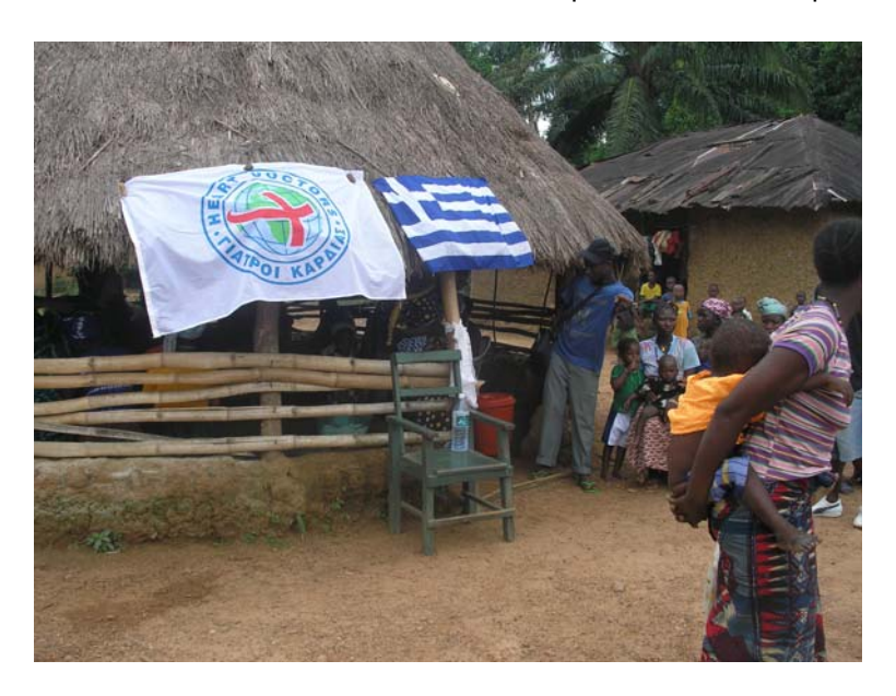
Outside the dispensary in Sierra Leone