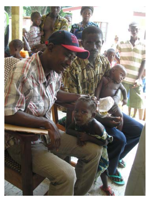
Parents with their sick children at the dispensary