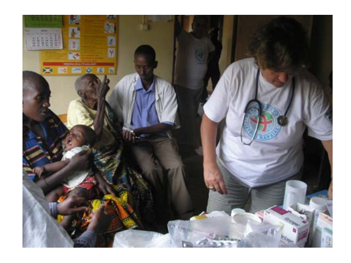
Patients at the dispensary

In this mission medical services were offered to patients living in the provinces of Bubanza and Kirundo. In the province of Bubanza, North Western Burundi, the team visited the commune Gihanga and specifically the village of Buramata where "Heart Doctors" have built schools and a medical center and have supplied fresh water for the village. In Kirundo the team visited the communities Burara, Cumvo and Vumbi. Many patients were examined and given the proper medication. Foodstuffs were distributed to homeless people from Rwanda.