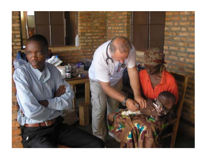
Injecting a child suffering from malaria