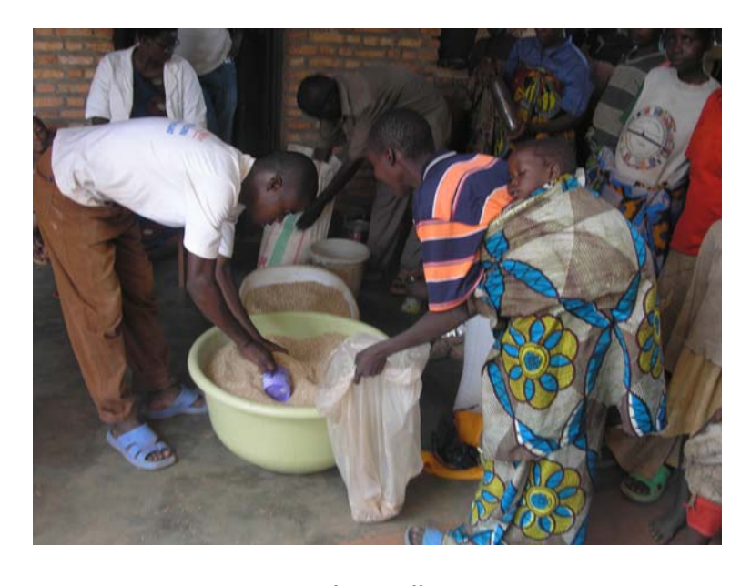
Distributing foodstuffs in Burundi

In Burundi, foodstuffs were also distributed to homeless refugees from neighboring Rwanda.