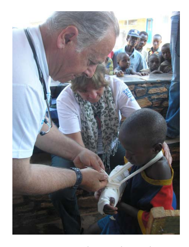
Provisional narthex fixed to a forearm fracture