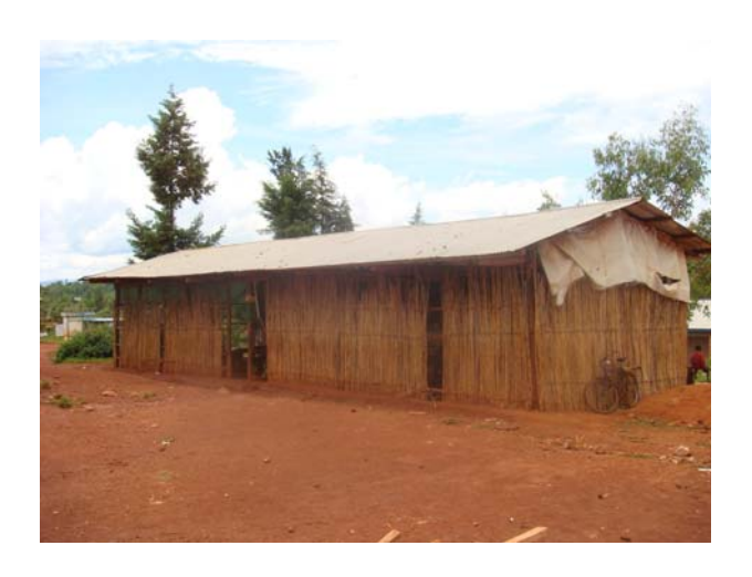
Nyabikere. The old school building