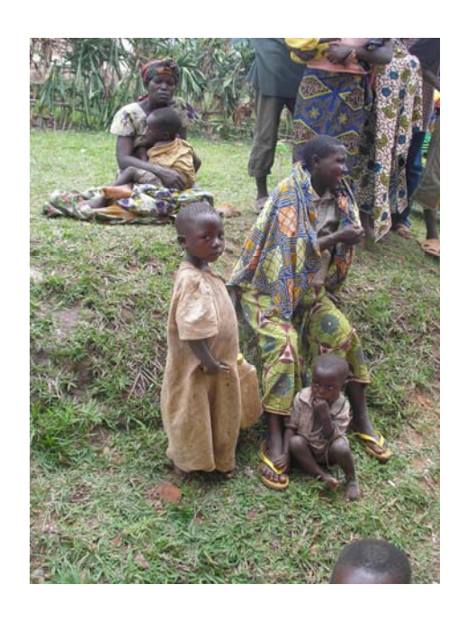
Outside the dispensary