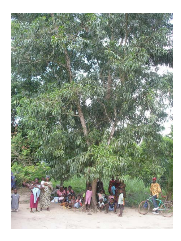
Patients gather under the trees