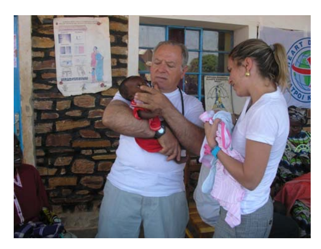
Baby suffering from malaria and anemia, dispensary at Gisuru