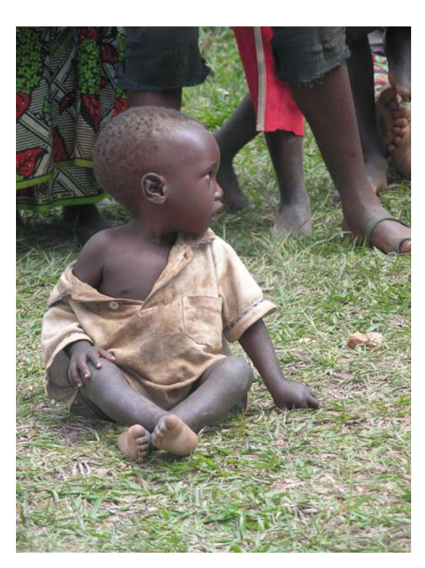
Outside the dispensary, waiting for the examination