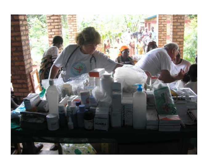
Dispensary in Kirundo