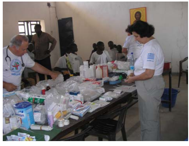
Dispensary in the Multi Use Hall of Saint Apostles Church, North Cameroon