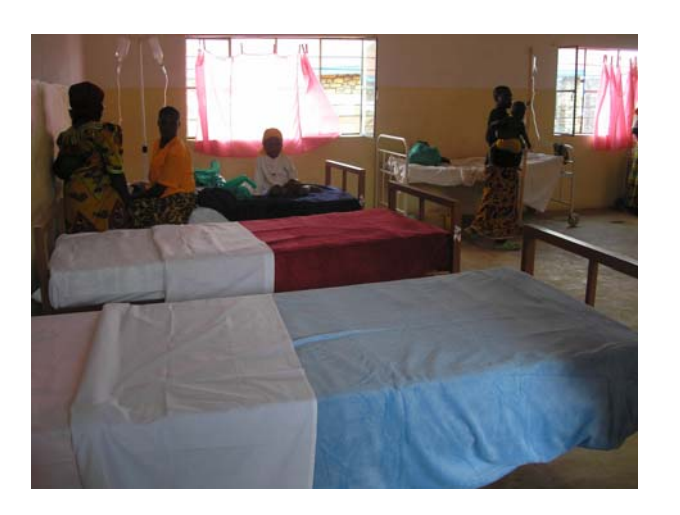
Gisuru hospital. Beds and bedding