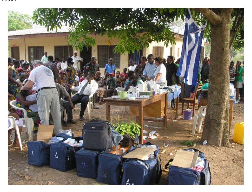
Open-air dispensary in Nigeria

A four member team of "Heart Doctors" was invited by the Governor of Benue State in Nigeria to visit the State and offer free medical services to various distant places of the country. The team examined many patients living in small communities in Usar-Kwande, Nyihemba, Agu CHC and Chito.