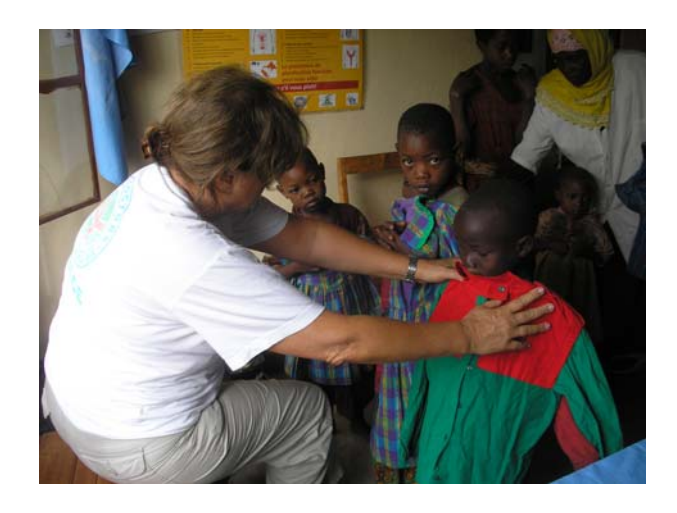
Clothing for children