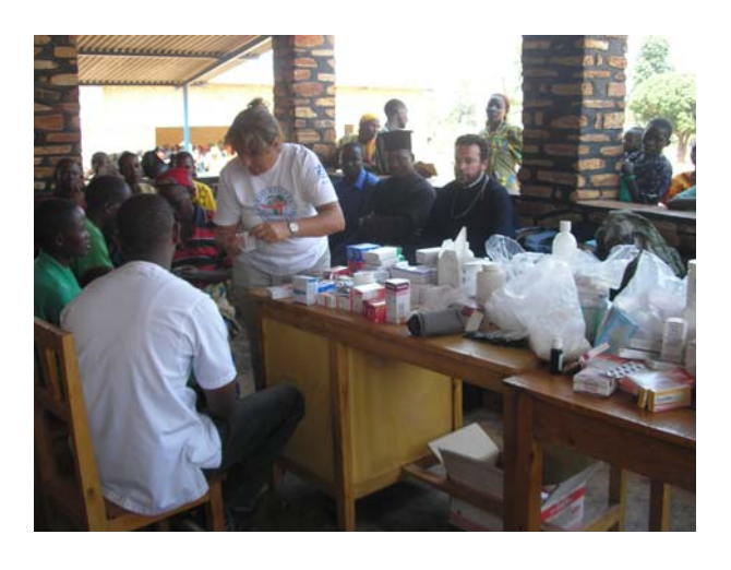
With the Archbishop of Rwanda-Burundi at Gisuru