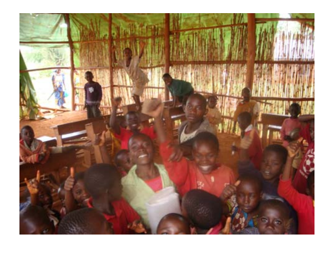
Nyabikere. The old school building

The foundation stone of this building was laid on the 4<sup>th</sup> of December 2009. "Heart Doctors" managed to secure the funds required to finance the project; they visited Nyabikere to inspect and coordinate the building works. On the 13<sup>th</sup> of March 2010 the school building was inaugurated by "Heart Doctors" in the presence of many officials, the governor of Karuzi, local Authorities and crowds of inhabitants. The new school building was given the name "Alxander the Great" and a commemotating signboard was walled outside the new building to display information of the event.