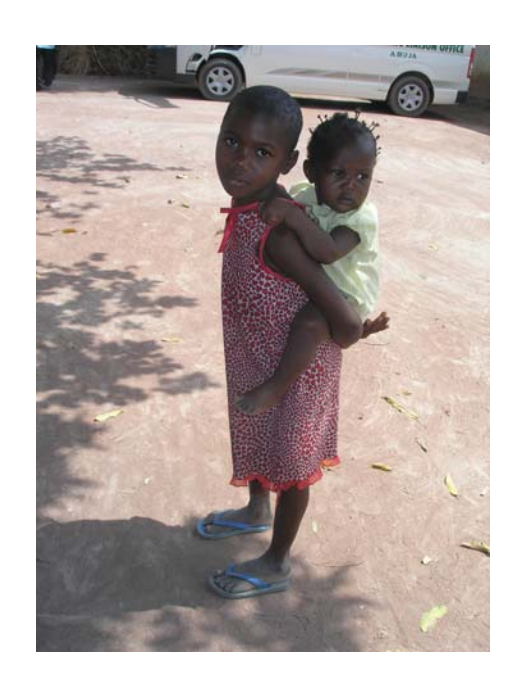
Carrying the baby on her back