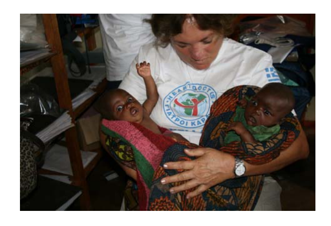
Twins in Burundi