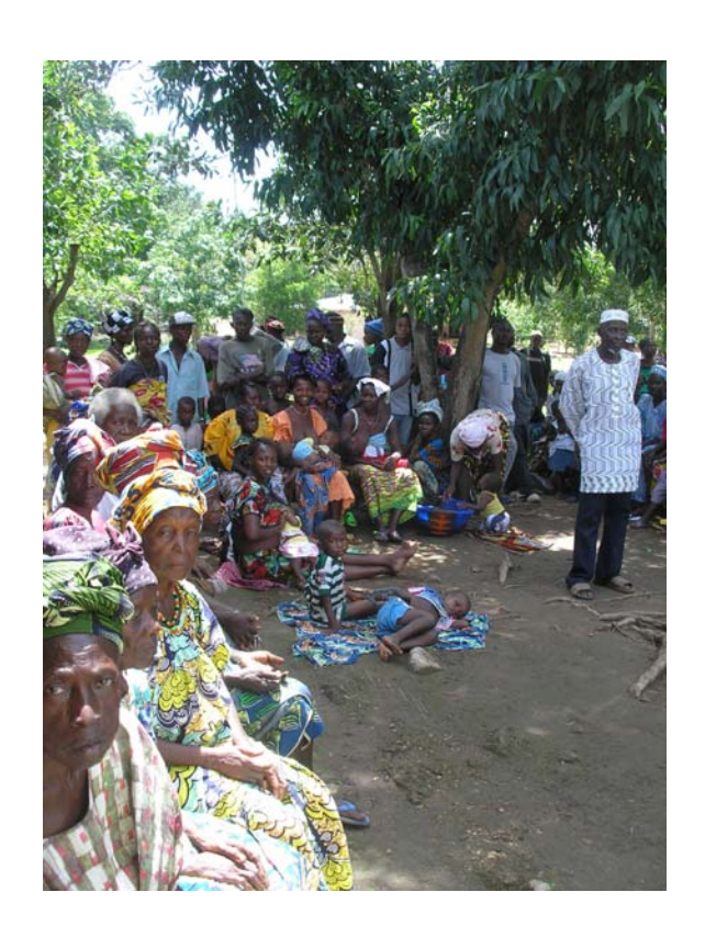
Queues outside the dispensary