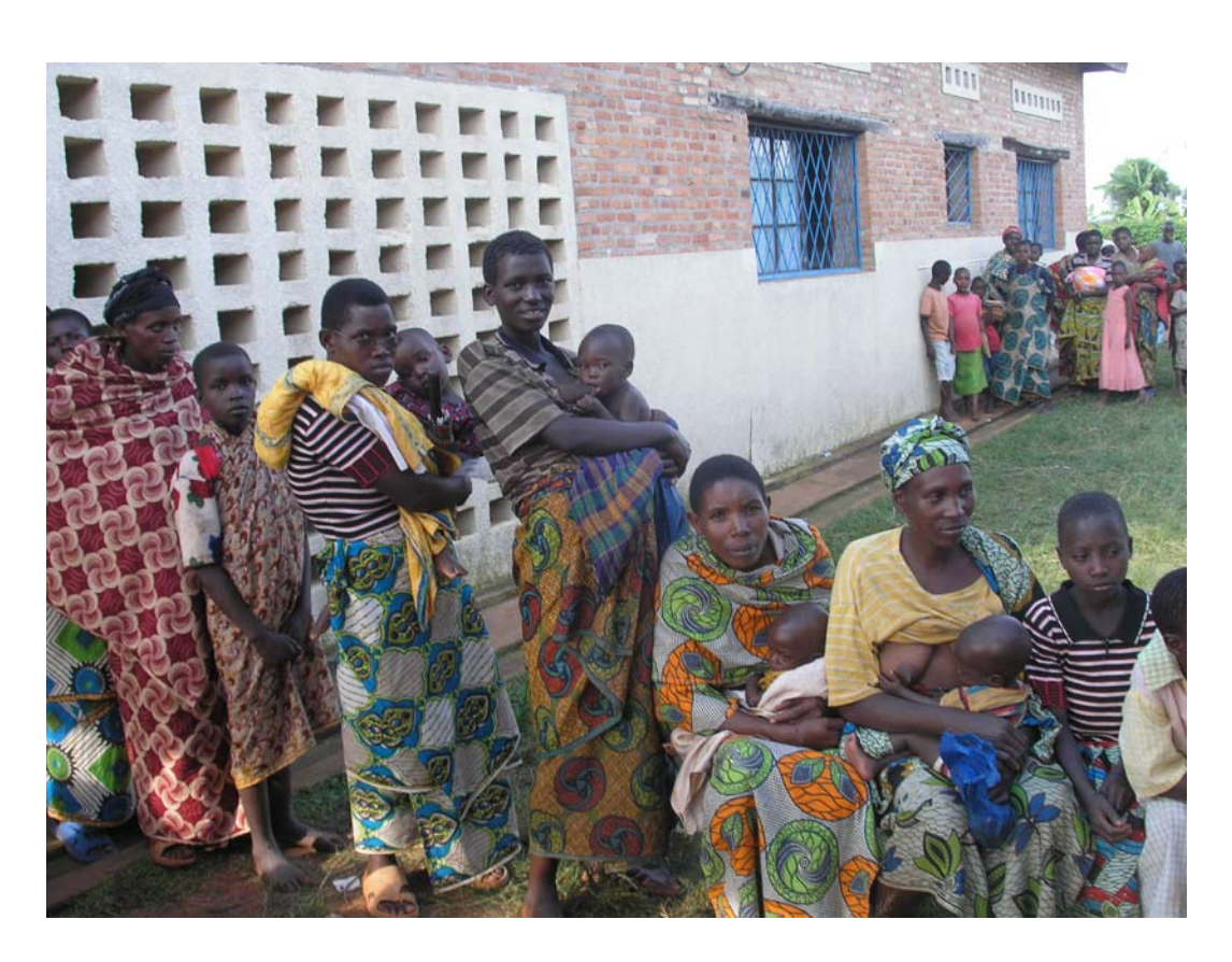
Mothers and children visiting the dispensary