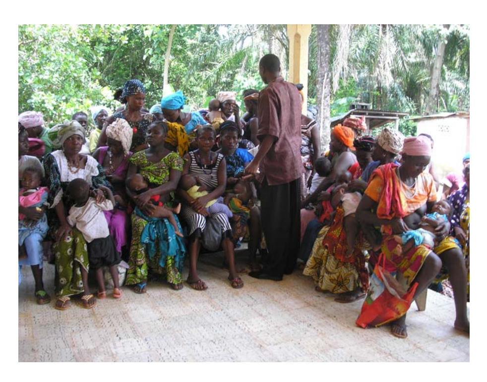
Sierra Leone, Outside the dispensary