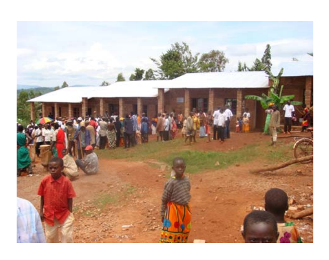
Neyabikere. The new school building