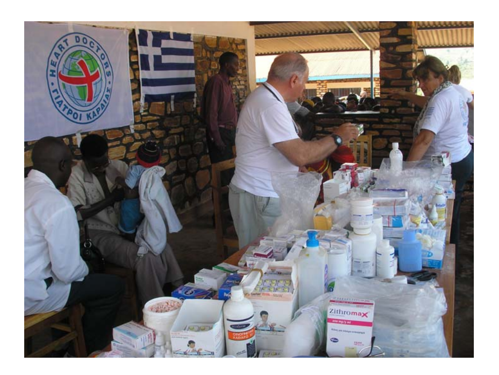
Dispensary at Gisuru

A team of "Heart Doctors" visited the province of Ruyigi, in Eastern Burundi, and offered medical services to sick people living in the wide area of Gisuru. This part of the province is a frontier area since Gisuru is located a few kilometers from the borders with Tanzania. "Heart Doctors" have financed a hospital complex at Gisuru and during this mission they offered beds and bedding to the clinics of the hospital. They also inaugurated a new wing of buildings which will be the residence of the nurses of the hospital. Clothing for children and foodstuffs were distributed.