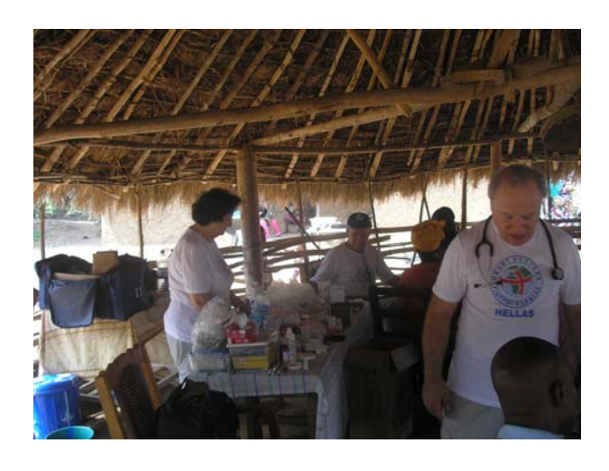
Dispensary in Sierra Leone