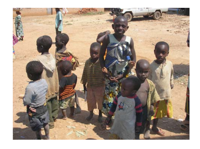
Children of Burundi