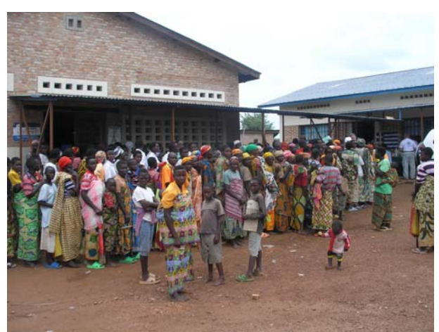
Patients waiting to be examined