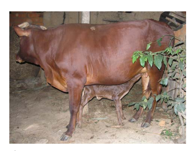
Cows distributed last year have now their newborn calves