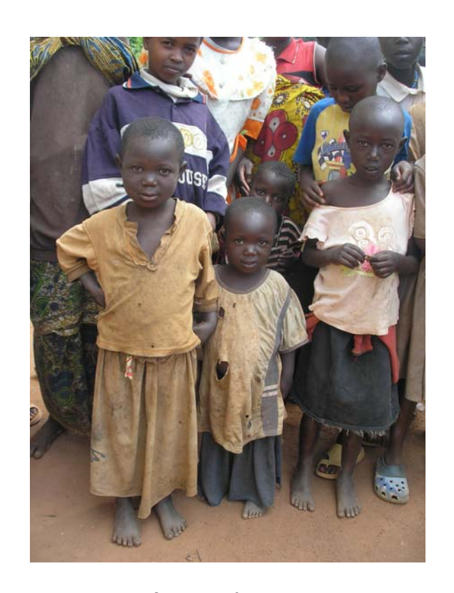
Children of Burundi