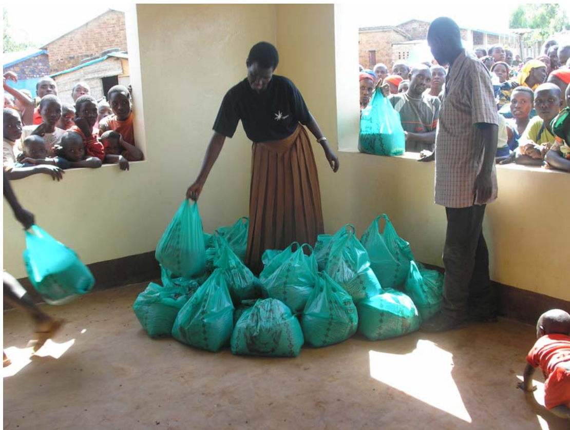
Distribution of foodstuffs in Burundi ( beans )