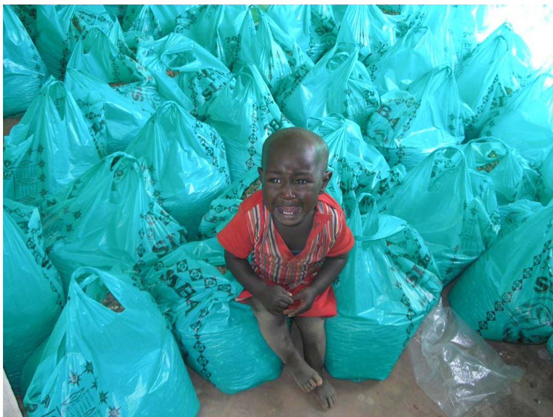
Distribution of foodstuffs in Burundi ( beans )