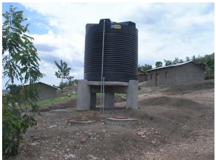
Water tank at Buramata.