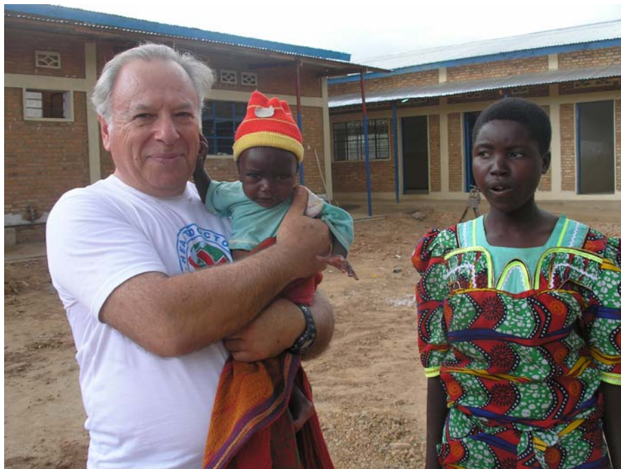
The five months old child who survived by milk from a cow

Many friends from Greece bought the cows we distributed to very poor families in Burundi in 2009 ( to make sure that the families in question could have some milk for their starving little children to protect them from dying ). A little child at the breast was dying because his mother had no milk to breast-feed it. "Heart Doctors" managed to find a villager who had a cow and paid him to give the child one kilo of milk daily for three months. Later "Heart Doctors" were very happy to see that the child was safe and in good health. Thus, friends were asked to buy cows and donate them to poor families in Burundi.