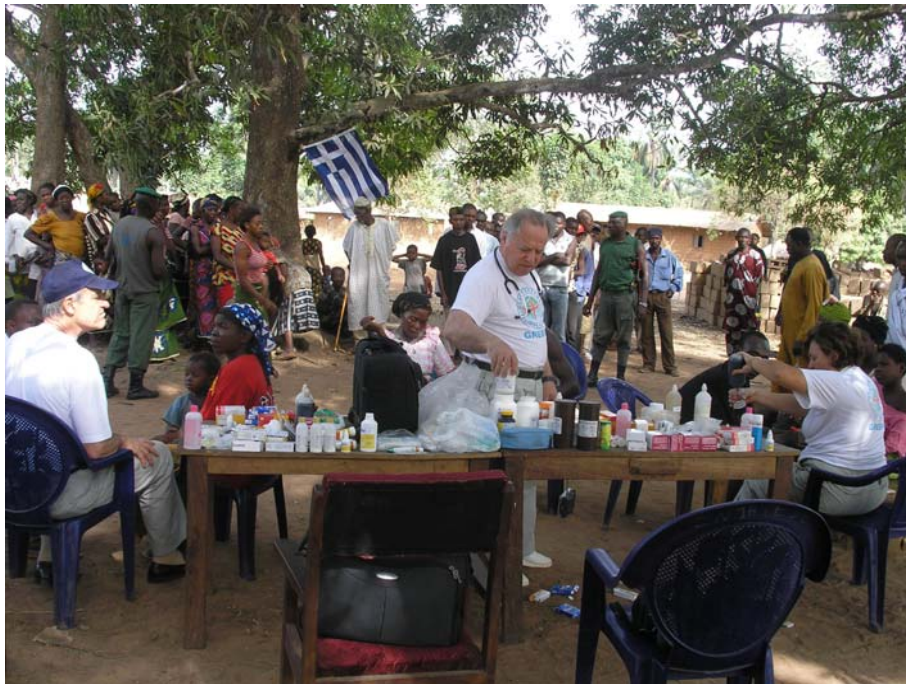
Nigeria, Benue State