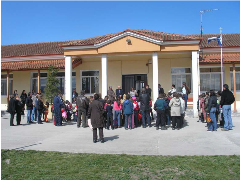
Visiting a Primary School of Irinoupolis