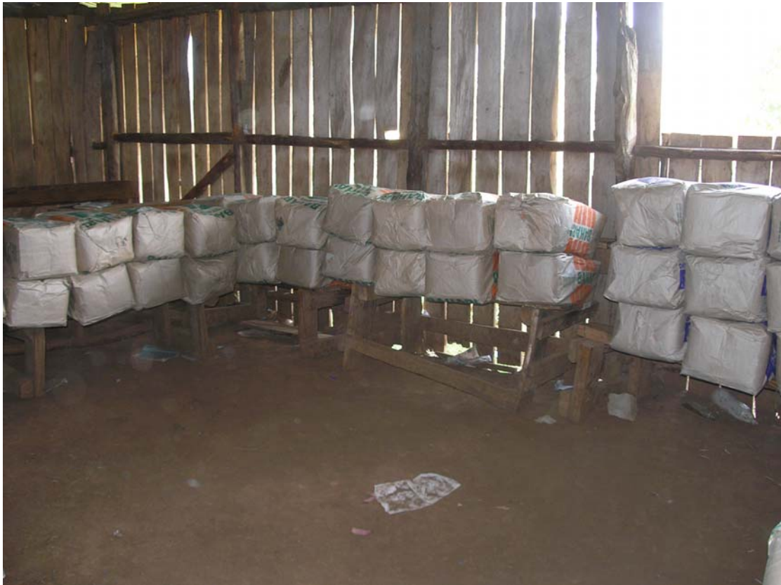
Distribution of foodstuffs in Kenya ( unga )