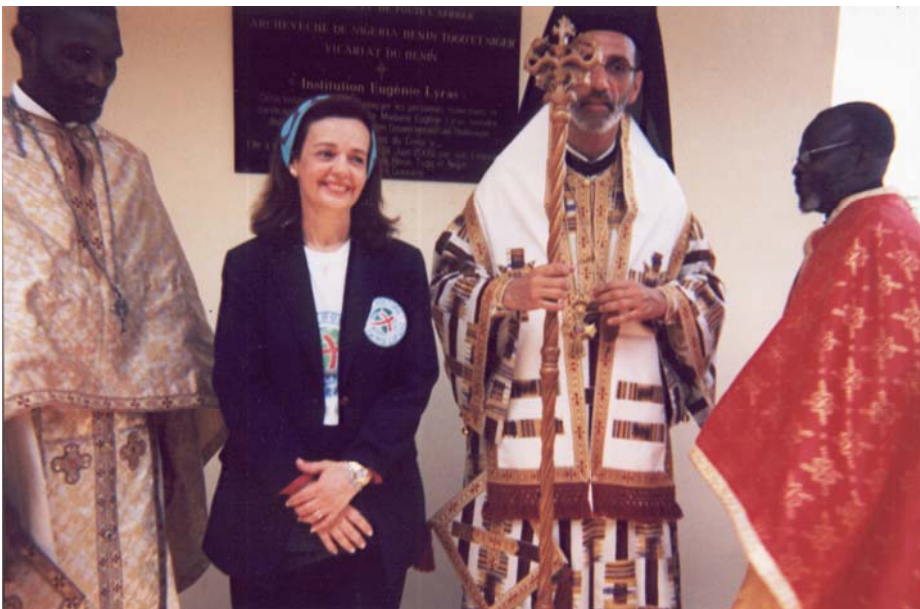
Porto Novo, Inauguration ceremony of the Shelter for the Blind