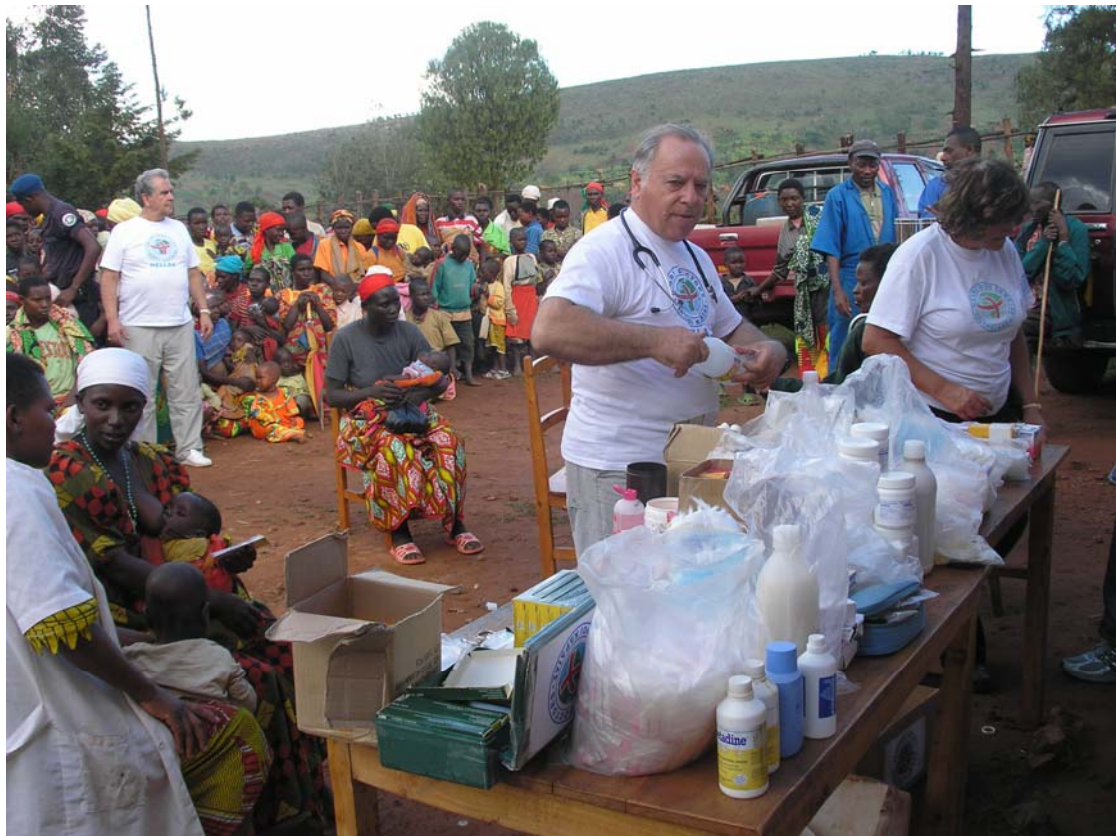
Burundi, Medical Camp