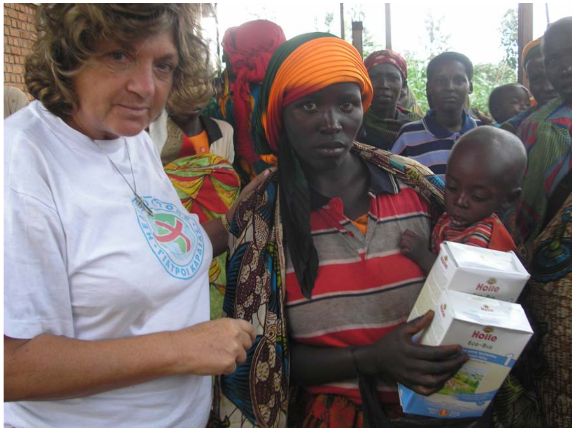
Milk for the child