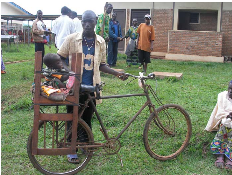
Improvised means of transportation