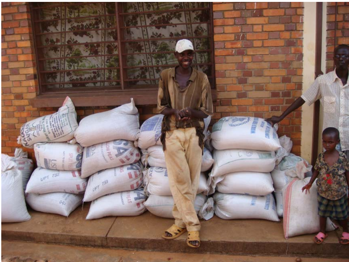
Distribution of foodstuffs in Burundi ( beans )