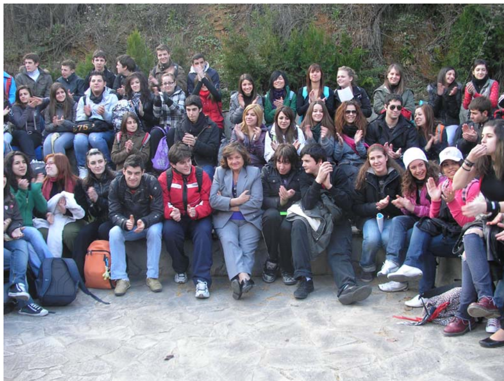
Visiting the 1st Lyceum of Naousa