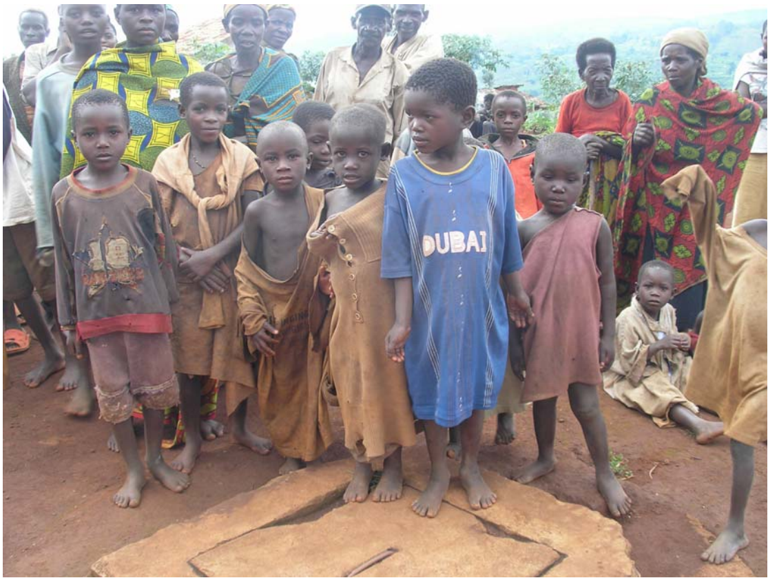
Children of Burundi