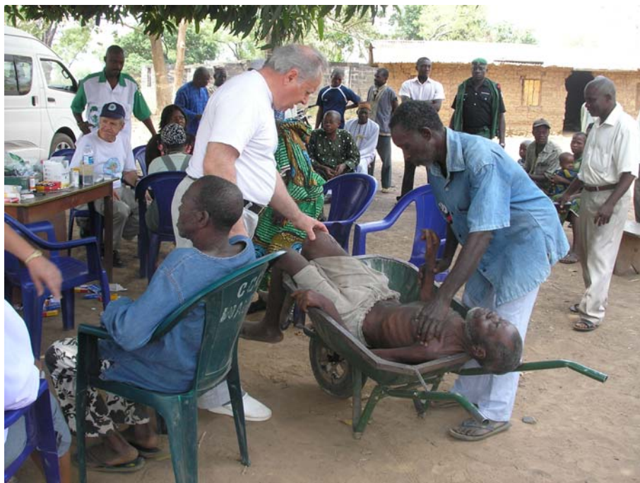
Nigeria, Benue State