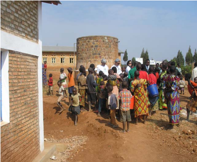
Water tank for the school at Gisuru

The school building constructed at Gisuru consists of 6 independent large rooms and an office for the school master and the teaching staff. The whole project was carried out in two phases. First the four rooms were finished and then the other two and the office of the school master were added. The official inauguration took place on the 29 th of October 2009.