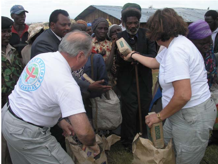
Kenya, Distribution of foodstuffs

Medical examination and treatment of patients in the area of Nairobi Archdiocese, the suburbs of Nairobi ( Kymende and Longai areas ) and in Massai land. Visit to the medical centre being erected at Kymende by Archbishop Makarios and financed by "Heart Doctors". Distribution of foodstuffs to starving families in the area of Molo.