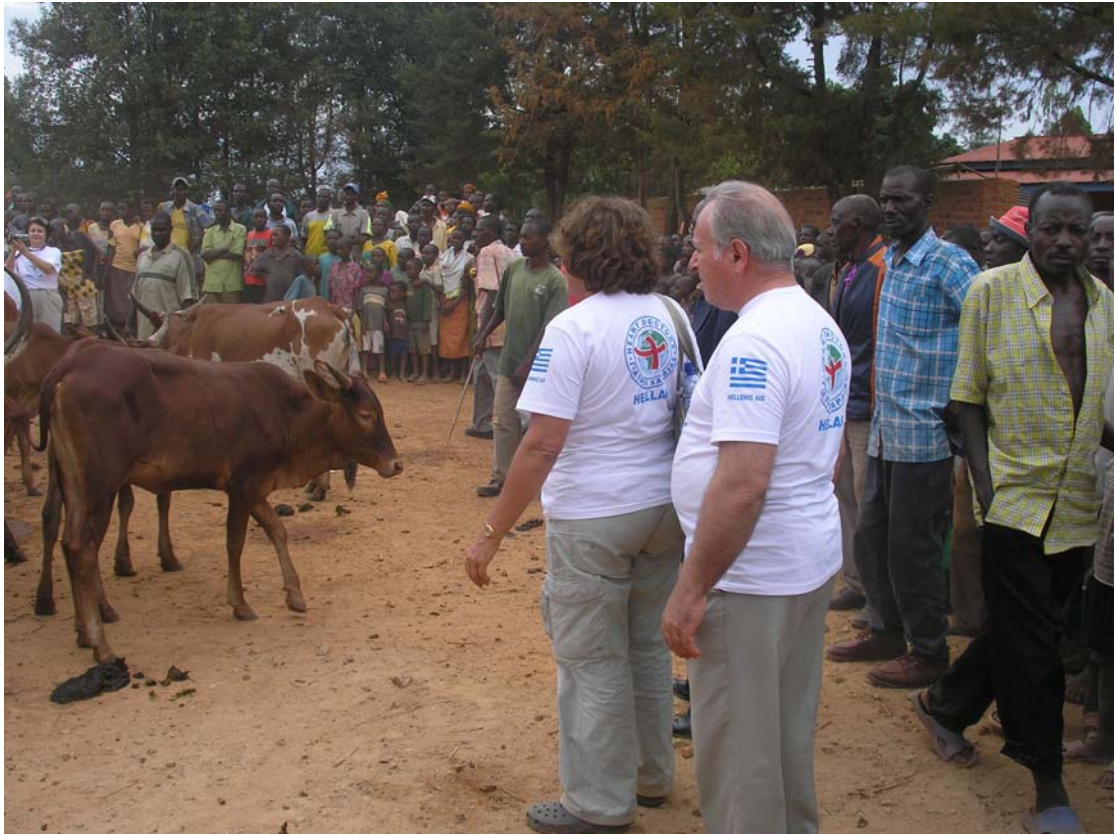
Distribution of cows at Gisuru