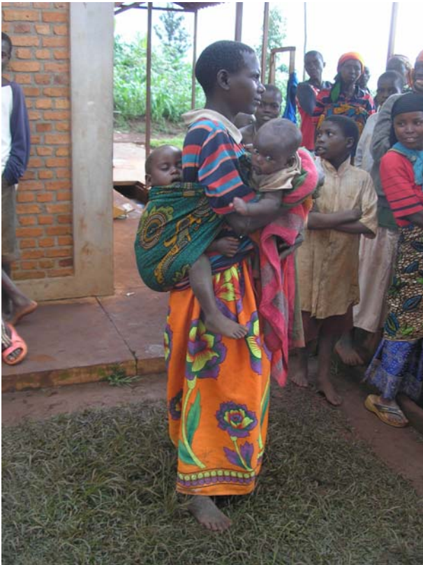
With her children at the dispensary