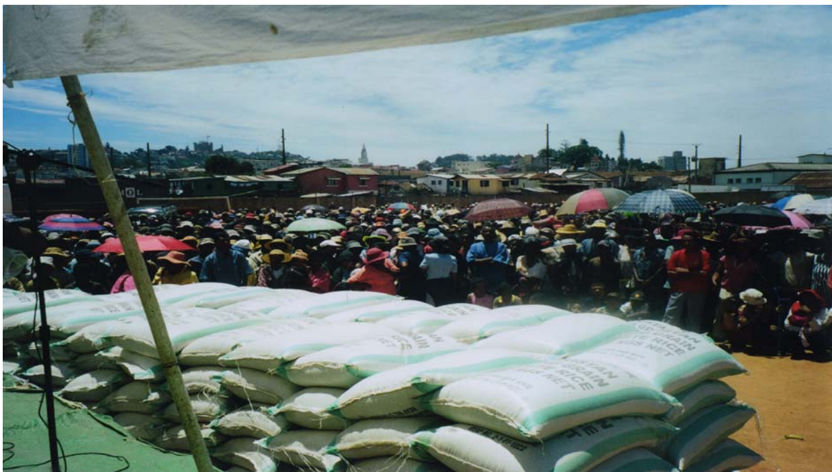
Distribution of foodstuffs in Madagascar ( rice )

We have to explain that in certain medical care missions to Burundi and Kenya, in addition to medical care and medicaments given in 2009, foodstuffs were also distributed to starving populations.