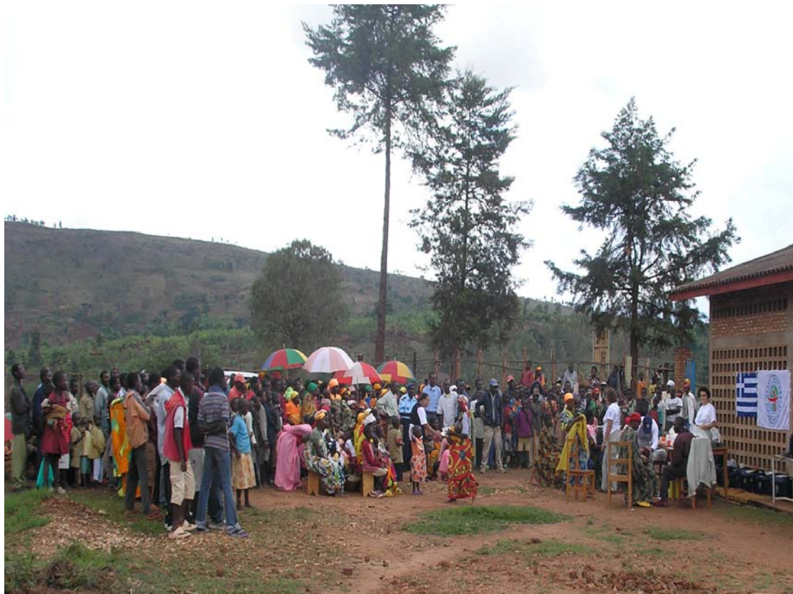
Medical Camp at Gisuru