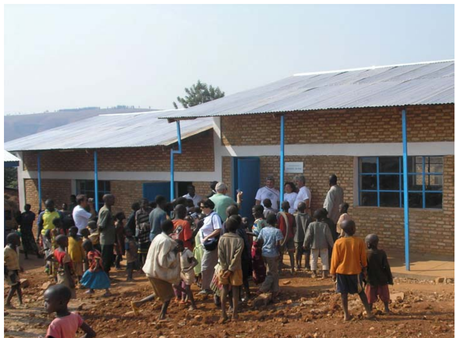
The new school at Gisuru