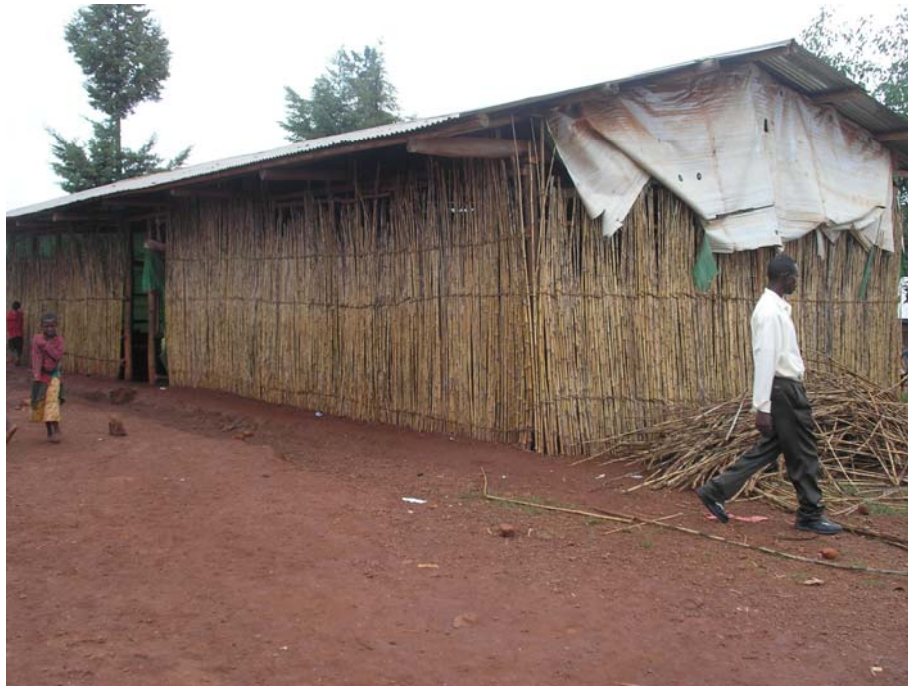
The old school at Nyabikere.