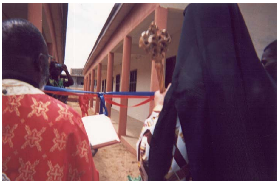
Porto Novo, Inauguration ceremony of the Shelter for the Blind