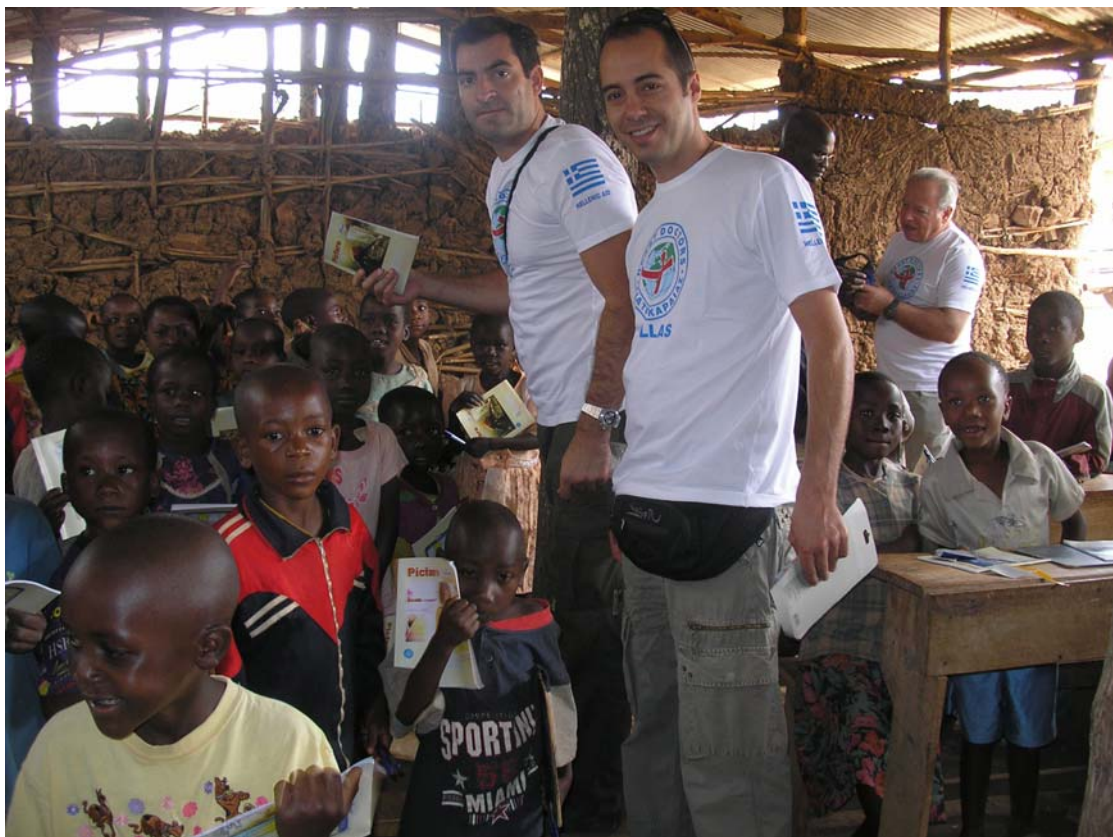
At the old school of Gisuru