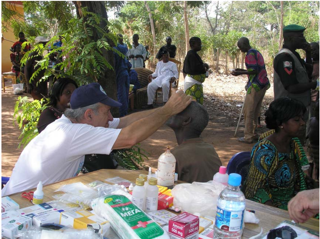
Nigeria, Benue State