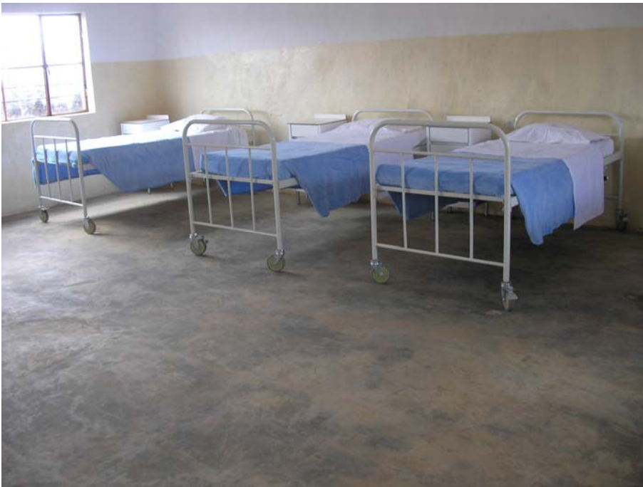
Pediatric clinic at Gisuru