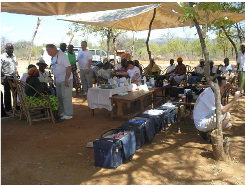
Medical Camp in Kenya