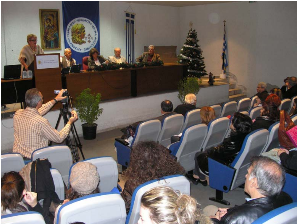
Visiting "Alexandrian" Technological Educational Institution of Thessaloniki