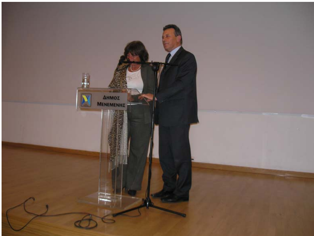
Visiting the municipality of Menemeni