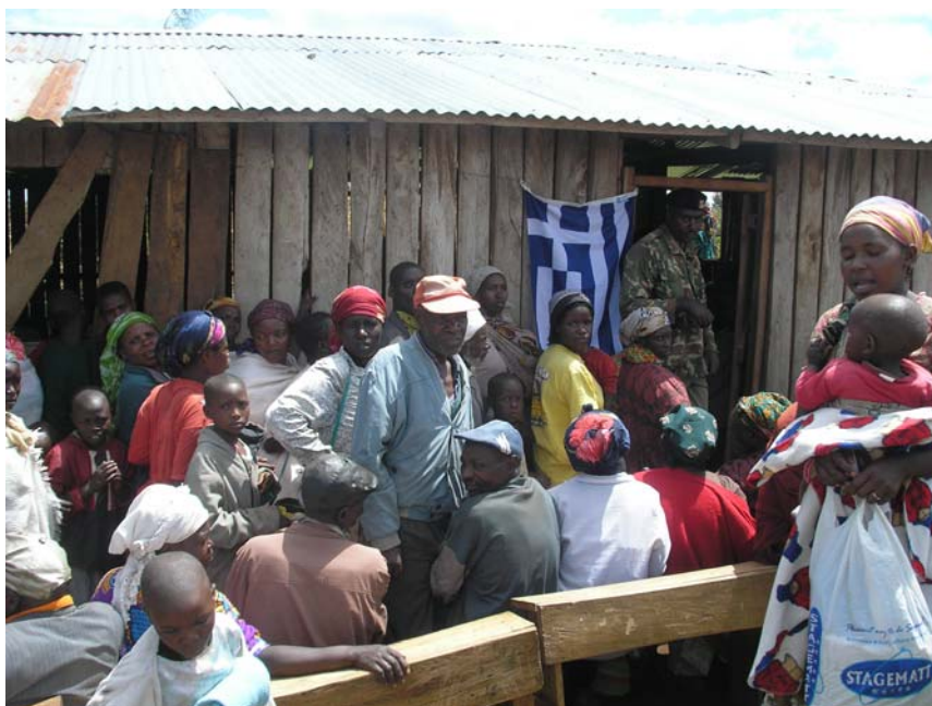
Kenya, Medical Camp