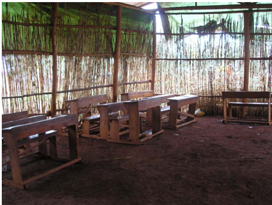
The old school at Nyabikere.