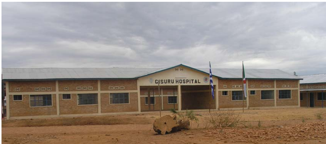
Administration Building of Gisuru Hospital, 2009