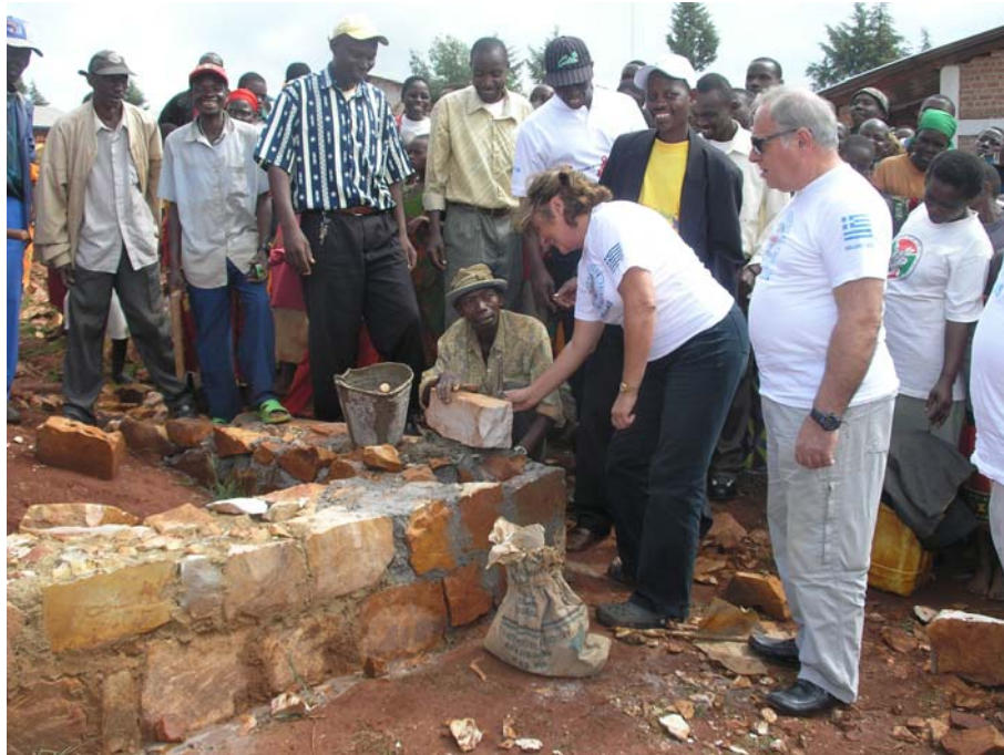
Foundation stone for the construction of a school at Karuzi

At the beginning of December 2009 the foundation stone was laid for the construction of a school building at Nyabikere village, in the province of Karuzi, Burundi. The school building is expected to be ready in three month's time.