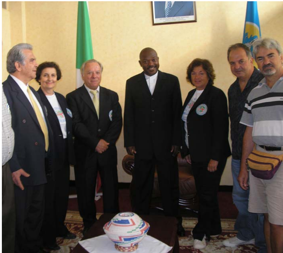
With the President of the Republic of Burundi