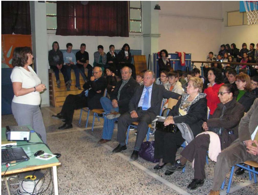
Visiting the High School of Kavasilá