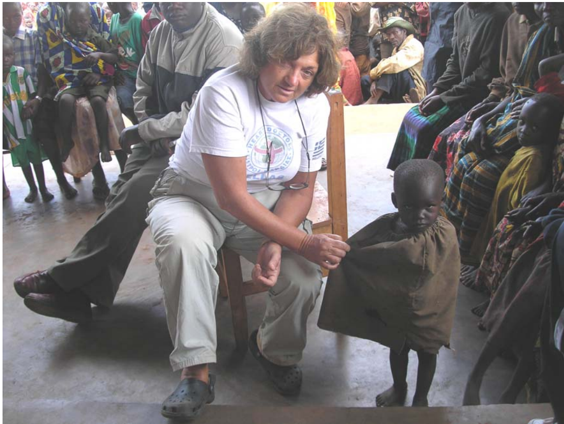
Burundi. A little girl wearing another girl's skirt from her neck down