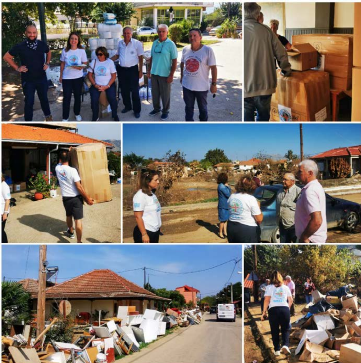
AID IN THESSALIA, GREECE