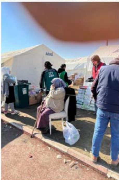
AID IN TURKEY