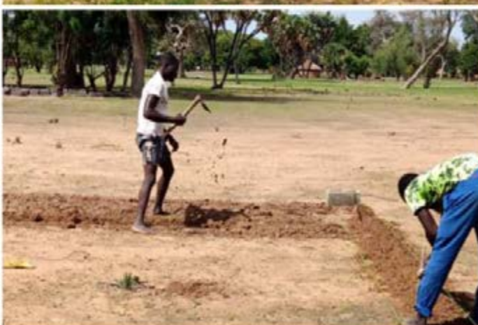
SCHOOL CONSTRUCTION IN CAMEROON